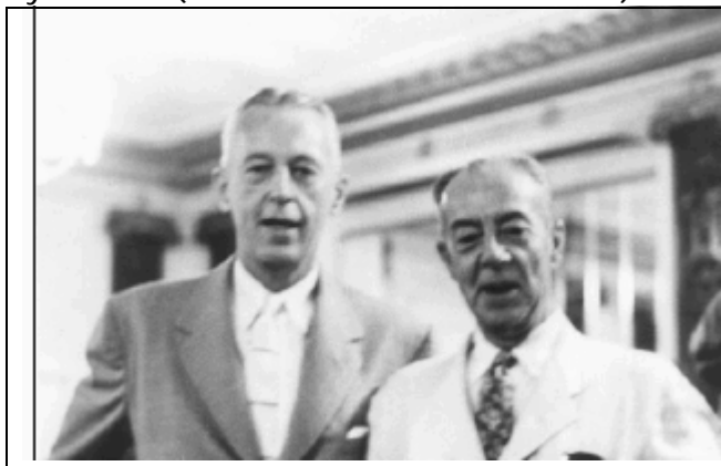
Bill W. with his Sponsor Ebby T.